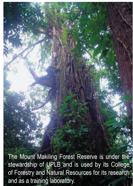
The Mount Makiling Forest Reserve is under the stewardship of UPLB and is used by its College of Forestry and Natural Resources for its research and as a training laboratory.

The revised curriculum introduces a required course on entrepreneurship to better equip forestry graduates as generators of employment. Courses on emerging technologies, including Geographic Information System (GIS) and watershed management, have been also included as core courses. The new curriculum likewise reflects a shift towards utilization of non-timber forest products like bamboo, resin, and rattan.