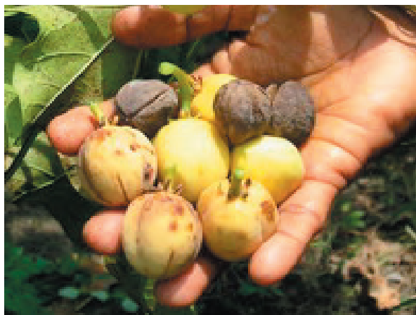
Jathropa fruits

Jathropa curcas , an erstwhile insignificant tropical plant that thrives in marginal soil unsuitable for food crops, has captured the world’s attention as one of the best sources of biofuel. Jathropa is unique in that oil from its seed can be used as biodiesel for any diesel engine without modification.