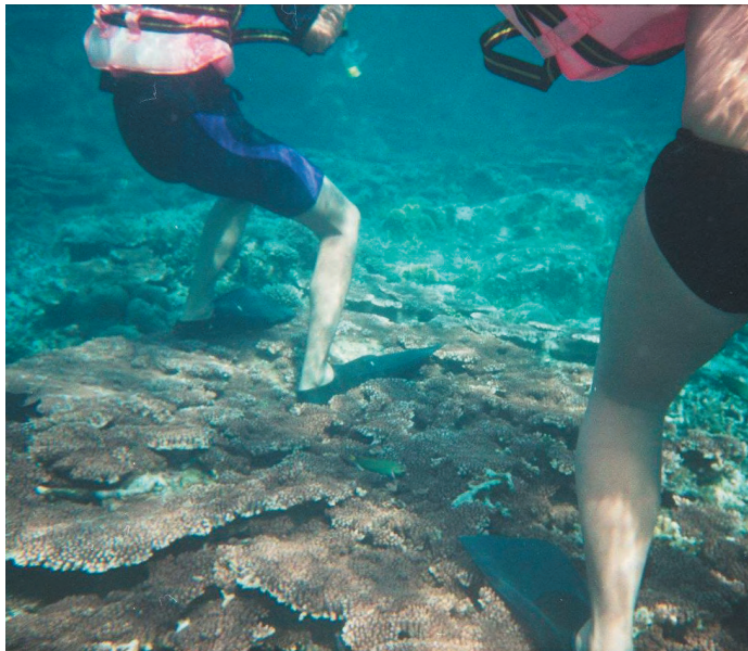
While pollution, global warming, and destructive fishing practices are key threats to reefs, tourism is also an increasing cause of damage to corals.

The forum was attended by more than 50 postgraduate and postdoctoral students from 20 countries. (Condensed from report of Professor Hoegh-Guldberg at UQ News Online)