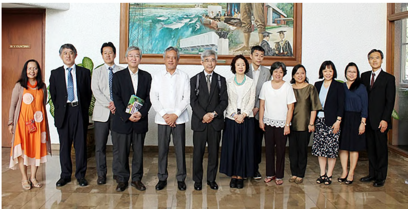
Officers and staff from Nagoya University (NU) pose with SEARCA Director and Program heads on 9 March 2016 during NU's visit to strengthen existing ties with the Center.

Officials and staff from Nagoya University and Kyoto University, two of the leading universities in Japan, visited SEARCA on 9 March 2016 to strengthen existing ties and explore possible areas for further cooperation with the Center.