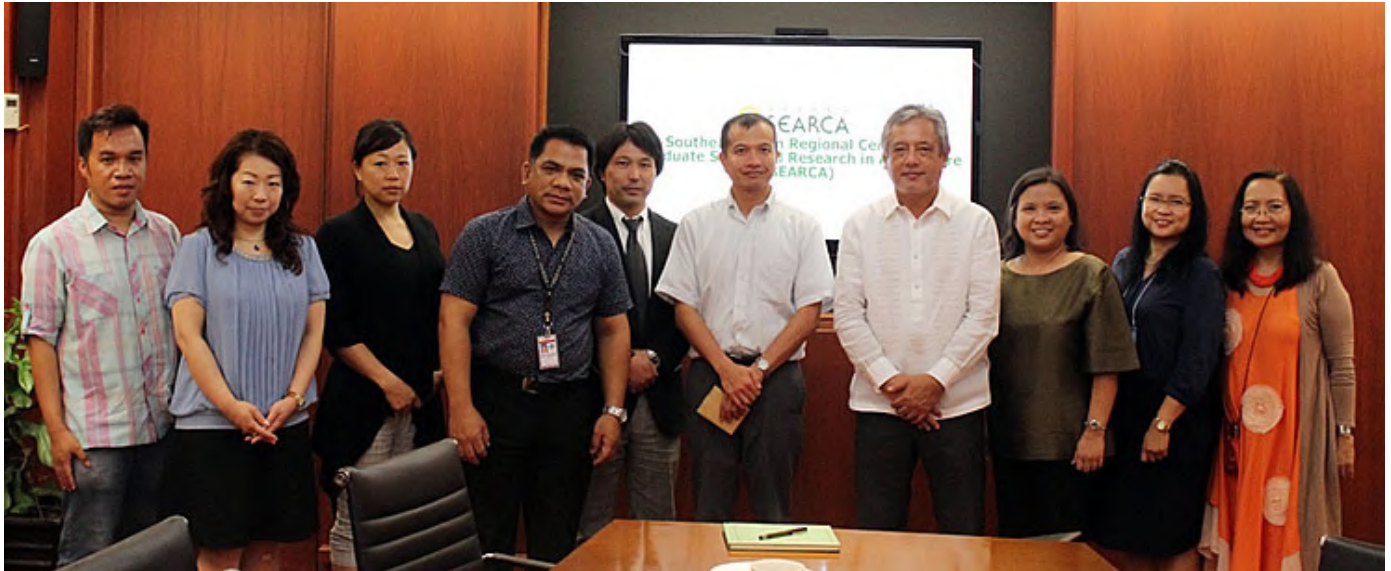
Photo taken during the visit of the delegation from Kyoto University at SEARCA.

proposal for the establishment of the Southeast Asian AgriMuseum and Learning Center to which both universities can contribute their technical expertise and resources.