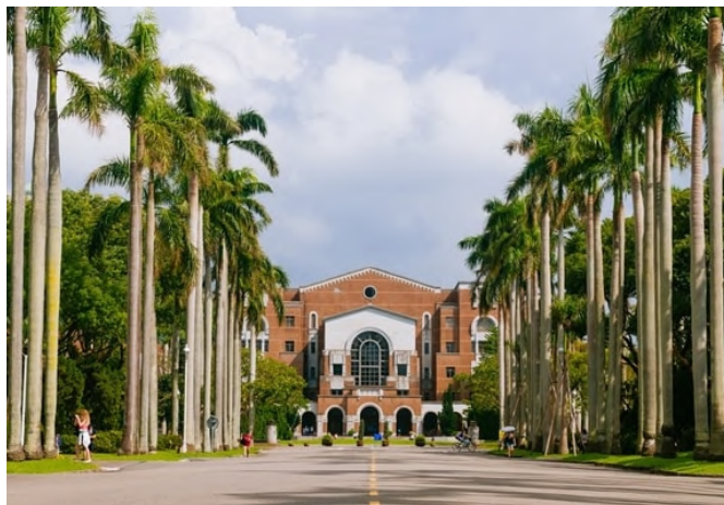
University News: NTU Receives an Unprecedented Number of International Applications - http://ntuhighlights.ntu.edu.tw/enews/83/#08

This AY 2021-2022, five more NTU-SEARCA scholars shall pursue the Master Program in Global Agriculture Technology and Genomic Science (Global ATGS) as part of the collaboration between SEARCA and National Taiwan University (NTU) which started in 2020. The first batch of NTU-SEARCA scholars began their studies in AY 2020-2021 and are now on their 2nd and final year.