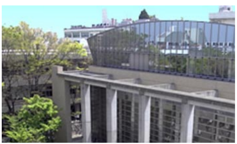
The 115-year-old Tokyo University of Agriculture takes pride in its continuing contribution to agricultural development in Japan and Southeast Asia through education and research.

Other societies established by TUA are the Japan Society for the Promotion of Science in 1978 and the International Society for Southeast Asian Agricultural Science in 1994. TUA has signed academic cooperation agreements with Kasetsart University in