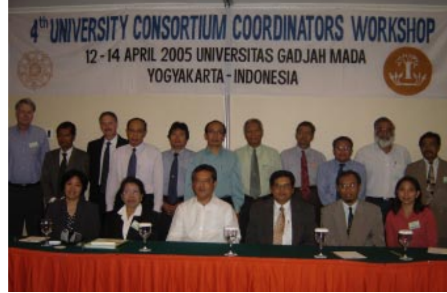
Participants of the "4th UC Coordinators Workshop" held in Yogyakarta, Indonesia on 12-14 April 2005.

The Workshop participants expressed their observations that graduate education in agriculture is still a very important focal concern and that the UC is one modality to address development needs in Southeast Asia through HRD and capacity building. They felt that since