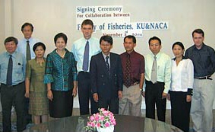
information platform on KU and NACA officials present at the signing of the MOU between the two institutions.

NACA is an intergovernment organization that promotes rural