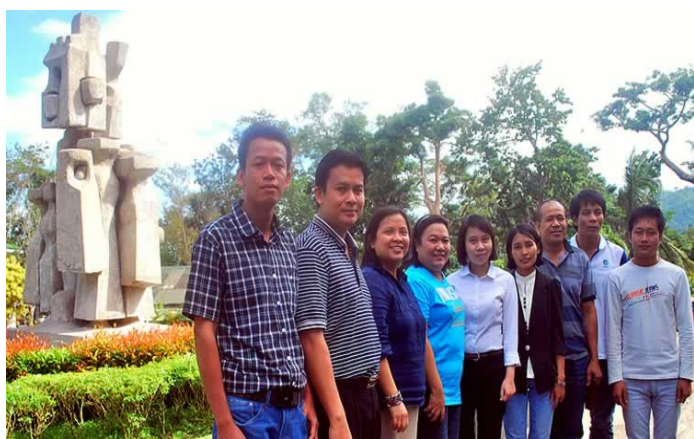
New SEARCA scholars at UPLB for 2nd Semester 2014-2015

As second semester of Academic Year 2014-2015 commences, SEARCA awarded nine more graduate scholarships to students from Lao PDR (2), Myanmar (4), Vietnam (1), Timor Leste (1), and the Philippines (1). All new scholars are posted at the University of the Philippines Los Baños (UPLB).