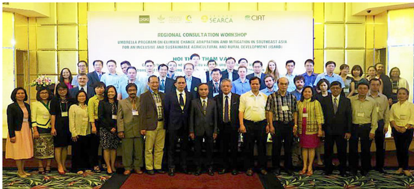
Guests and participants of the Regional Consultation Workshop towards an Umbrella Program on Climate Change Adaptation and Mitigation in Southeast Asia for an Inclusive and Sustainable Agricultural and Rural Development.

HANOI, Vietnam – The Regional Consultation Workshop towards an Umbrella Program on Climate Change Adaptation and Mitigation (CChAM) in Southeast Asia (SEA) for an Inclusive and Sustainable Agricultural and Rural Development (ISARD) was held at Fortuna Hotel in Hanoi, Vietnam on 12-14 May 2015.