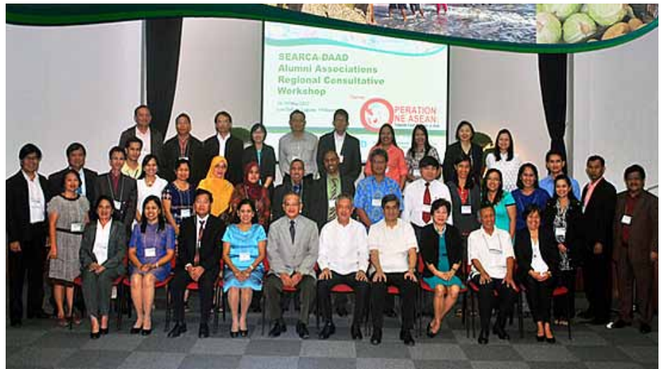
SEARCA Graduate alumni from Cambodia, Lao PDR, Indonesia, Myanmar, the Philippines, Thailand and Vietnam gather for the two-day workshop on food security.