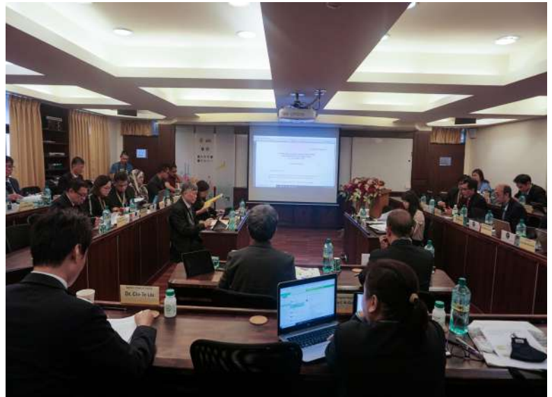
UC Executive Board planning for 2020.

The UC was established in 1989 through SEARCA's initiative to share resources and collaborate on student and faculty exchanges among leading agricultural universities. Now on its 30th year, the UC continues to offer competitive student and faculty grants and activities hosted by the different member institutions on a rotation basis. The UC also engages in dual or joint degrees as well as collaborative research studies among the members and institutional partners outside Southeast Asia.