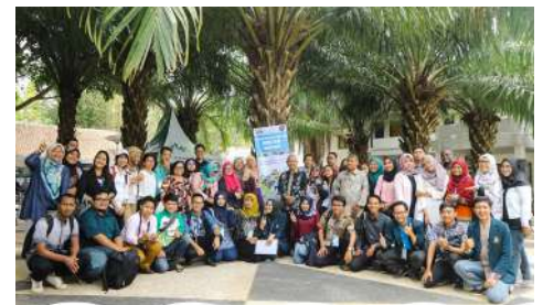
Universitas Brawijaya hosted the 4th UC Graduate Forum in 2018.

During the planning of the UC Executive Members for 2020, UB once again committed to become the host of another major activity which is the Summer School. This activity is a postgraduate course designed to enhance the understanding of students and other professionals in rural studies, agriculture and natural resource management on the importance of the interdisciplinary approach in tackling the issue of food and nutrition security in Southeast Asia for sustainable development. Previous hosts of the Summer School include University of the Philippines Los Banos (UPLB), Kasetsart University (KU), Universitas Gadjah Mada (UGM), and Universiti Putra Malaysia (UPM). For more information and updates about the Summer School, visit https://uc.searca.org/projects/summer-school