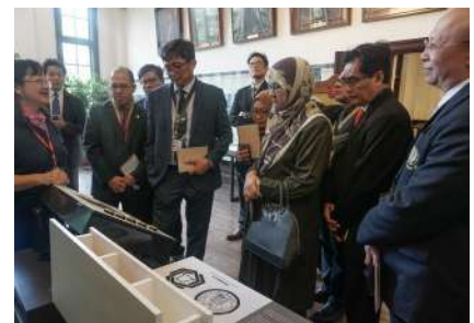
The UC Executive Board Members during the visit to NTU's Gallery of University History.

Revolution. For more information about the upcoming Faculty Forum, visit https://uc.searca.org/ for updates.