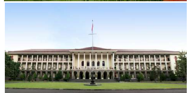
(Top) IPB ranked 1st Place and (Bottom) UGM ranked 3rd place in the Higher Education Clustering 2020 in Indonesia