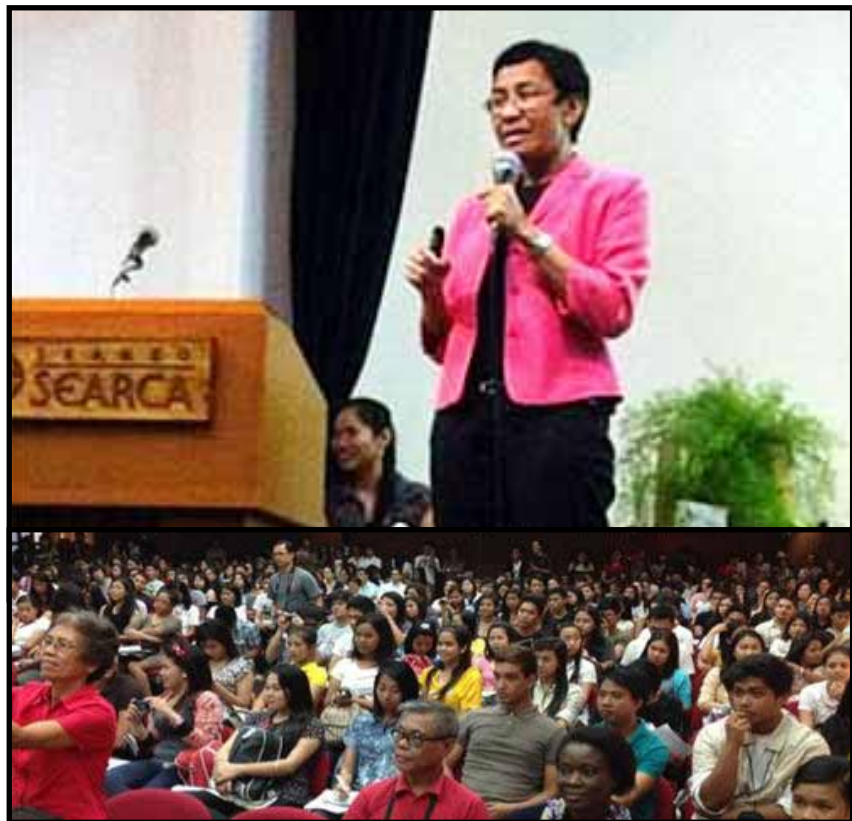
Rappler CEO and Executive Director Maria Ressa speaks before the jam-packed SEARCA Umali Auditorium

Rich media, meanwhile, means using technology such as iPhones that enable you to transmit all [information] immediately. “It’s faster than anything!” she enthused. Capturing the best features of these circles are