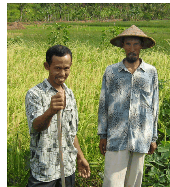
The impacts of climate change on the productivity of farmers need to be taken seriously to avoid social problems in the future.