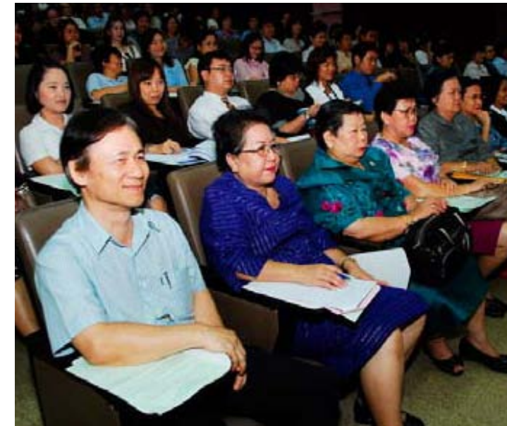
Faculty members of Kasetsart University attend the KU Annual Seminar 2010, which tackles student-centered teaching.

Each faculty arranged its activities and shared its good practice on student-centered pedagogy. Some interesting seminar topics were “Moral Compass and Wisdom Help Getting through Obstruction,” “Strategies and Action Plans of Kasetsart University for Academic Development and Teaching,” “Best Practice on Student-Centered